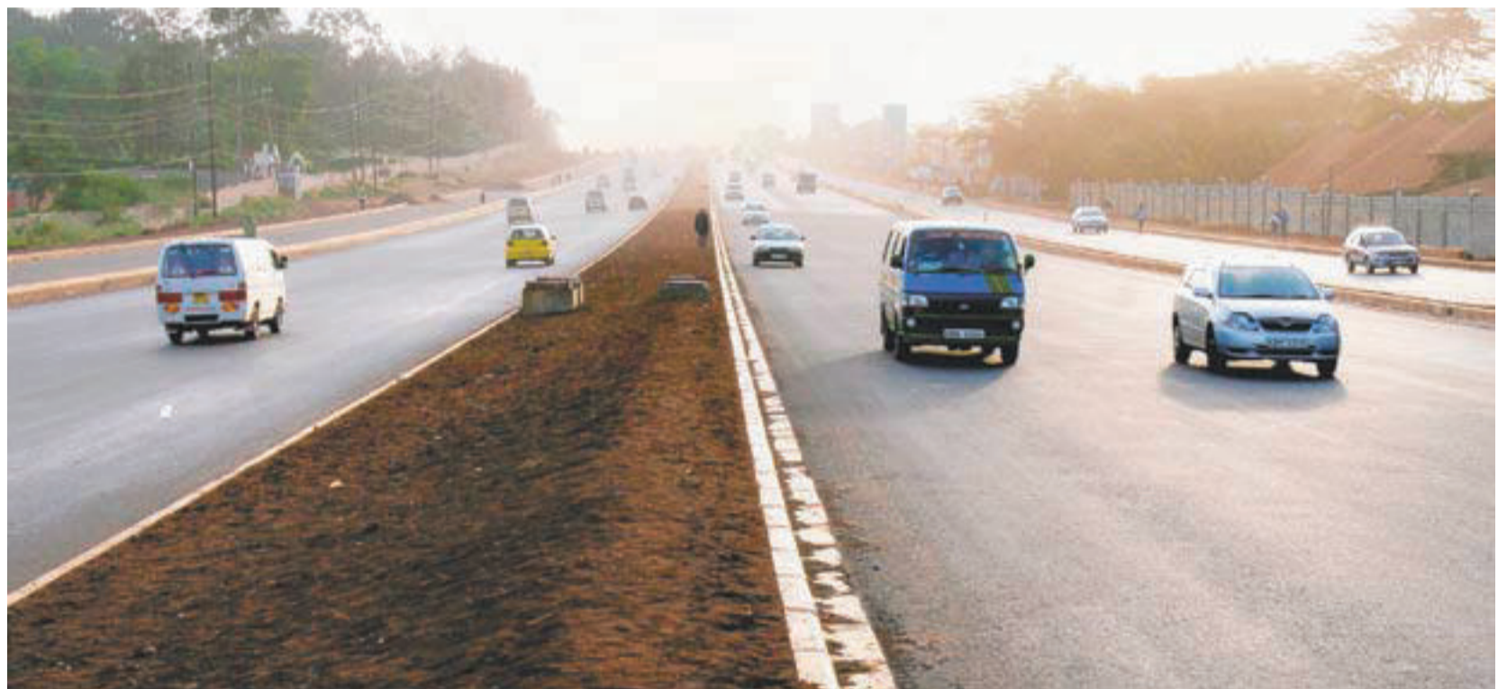
Traffic flows near Safari Park Hotel on a section of the expanded Thika Road, one of the showpiece infrastructure projects expected to be completed in 2011.

Kenyans usher in the New Year with optimism that reforms and the economic gains realised last year will lead to better times in 2011. This is a view shared by President Kibaki and Prime Minister Odinga in their messages to Kenyans and by a cross-section of business, NGO, religious and union leaders interviewed by the Saturday Nation this week. SPECIAL REPORT: Pages 8, 9, 10 & 11